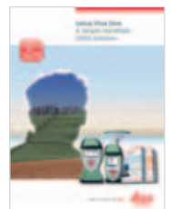
Leica Viva Uno Product brochure