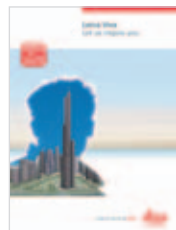
Leica Viva Overview brochure

Illustrations, descriptions and technical data are not binding. All rights reserved. Printed in Switzerland – Copyright Leica Geosystems AG, Heerbrugg, Switzerland, 2010. 781652en – IX.10 – RDV