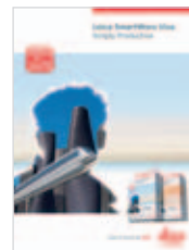
Leica SmartWorx Viva Product brochure