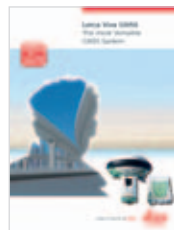
Leica Viva GNSS Product brochure