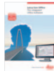
Leica Viva LGO Product brochure